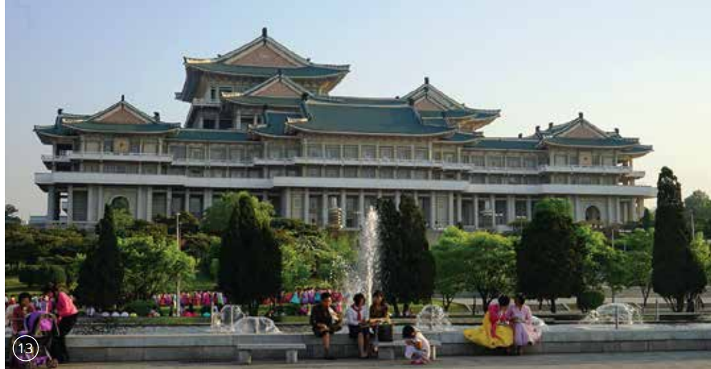
Images: 13. Grand People's Study House, 14. The Golden Mask Dynasty, 15. Hutong Life Tour, 16. Chinese Kung Fu Show, 17. View from Juche Tower Observation Deck, 18. Circus Show, 19. USS Pueblo, 20. Pyongyang Schoolchildren's Palace performance.