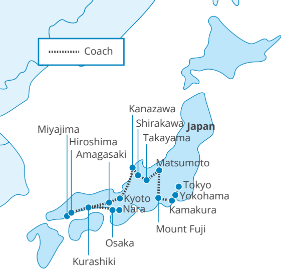
Images: 9. Arakurayama Sengen Park & Mount Fuji 10. Nikko Toshogu Shrine, 11. Kegon Waterfall, 12. Tokyo DisneySea, 13. Tokyo Disneyland, 14. Nara Park, 15. Tokyo Sky Tree, 16. Gion.