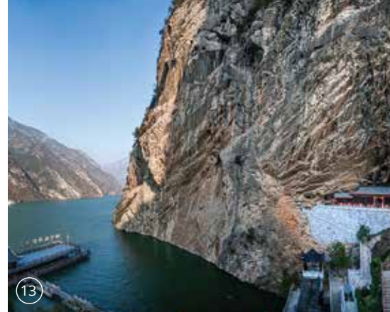
Images: 12. Yangtze River 13. Shore excursion 14. Yangtze Gold Cruise

A Yangtze River cruise is the thrill of a lifetime. You will enjoy the stunning picturesque scenery and amazing natural beauty of the famed Three Gorges: Qutang, Wu, and Xiling, while exploring historical relics and ancient cultural sites along the mighty river.