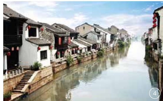
Images: 1. The Bund, 2. Tiananmen Square, 3. Summer Palace, 4. Wuxi, 5. Terracotta Army, 6. Suzhou, 7. Wild Goose Pagoda, 8. Great Wall, 9. Water Cube, 10. Enduring Memories of Hangzhou, 11. SPIRAL Acrobatic Show