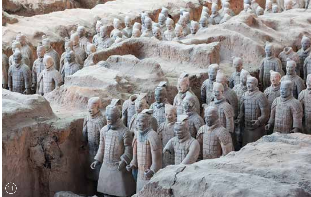
Images: 10. Ancient City Wall, 11. Terracotta Army