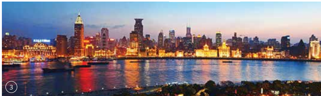
Images: 1. Wuzhen water town, 2. Xingping River Cruise, 3. The Bund, 4. Summer Palace, 5. Chinese acrobatic show, 6. Terracotta Army, 7. Old Town Shanghai, 8. Chengdu Research Base of Giant Panda Breeding, 9. Lingerin Garden, 10. Great Wall